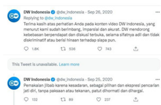
Fig. 4 DW Indonesia’s Reply on News Content “Children, Their World, and Hijab”