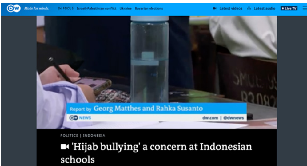
Fig. 5 DW Indonesia’s News Content “‘Hijab Bullying’ a Concern at Indonesian Schools”