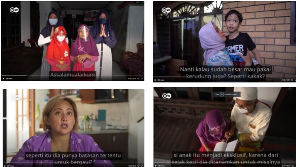
Fig. 3 DW Indonesia’s News Content “Children, Their World, and Hijab”