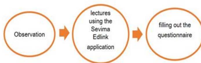
Figure 1. Research design

Descriptive research with a quantitative approach is used in this research at the end of the odd semester of 2021–2022. The population in the study were students of the Muhammadiyah Maumere Teachers' Training College, and the sample in this study was 3rd and 5th-semester Physics Education students of the Muhammadiyah Maumere Teachers' Training College, a total of 20 people. Sampling using a simple random sampling technique. The data collection technique used in this study was a questionnaire technique. Questionnaires were distributed to physics education students in semesters 3 and 5 who had attended online thermodynamics lectures via Google form. The number of questions in the questionnaire is 37 items. The questionnaire was used to measure student responses to using the Sevima Edlink application in thermodynamics lectures based on indicators of independent learning ability, student interaction with content, student interaction with lecturers, and interaction between students during online learning. The scale used is the Likert scale. The design in this study is made as shown in Figure 1.