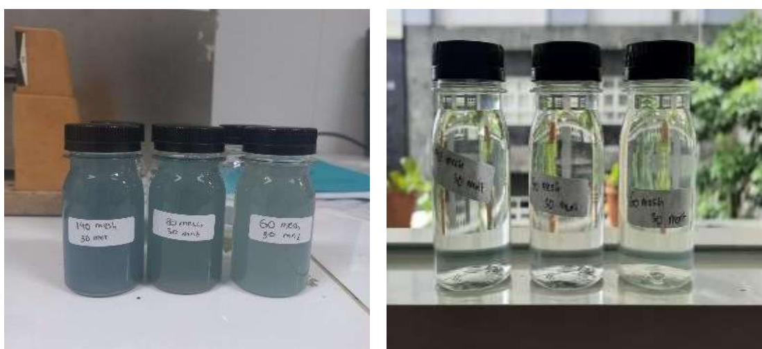
Fig.2 Leachate of nickel slag extraction (a) before destruction (b) after destruction

Leaching has been carried out for each sample variation and then the leaching results are first filtered using filter paper and then the results are put into each 50 ml sample bottle. The result of leaching process is depicted