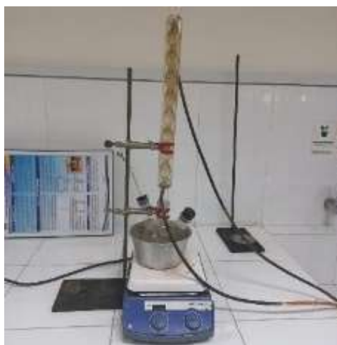
Fig.1 Leaching equipment set

This step was conducted for extracting metals, especially iron from nickel slag. The research was conducted based on the previous research method that has been done [8]. The leaching process was carried out using equipment that depicted in the Figure 1. The equipment comprised a three-neck flask assembled together with a magnetic stirrer, thermometer, stand, and upright cooler. Process leaching was done by mixing 60 ml sulfuric acid 2M with 15 g of nickel slag. Leaching temperatures used in the research was 100°C. The flask was immersed in the oil during heating process to reach a stable temperature. The experiment was conducted at various temperature and sulfuric acid concentration. that was based on several literatures which is based on the results of research conducted by previous researchers [8].