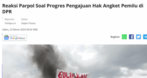
Fig. 1. Political Party Reaction to The Progress of Submitting the Election Inquiry Rights to the DPR

This news article contains responses from members of several political parties, namely PDIP, Nasdem, PPP, PKS, and PKB, to the discourse on the proposal of the Election Inquiry Right in the House of Representatives (DPR). The Defining problem of this news is that the alleged election has led to the discourse of the right of inquiry to investigate the alleged election fraud. Tempo.co reported the events of various reactions from political parties such as PDIP, Nasdem, PPP, PKS, and PKB that have not yet determined their stance on the inquiry right of election discourse. Meanwhile, the diagnose causes of Tempo.co’s first news is the lack of certainty from the parties because each party still has its agenda such as PDIP waiting for direction from the chairman, Nasdem focusing on national interests, PPP taking care of the party’s votes in parliament, PKS still waiting for support for the inquiry right, and PKB in the process of synchronizing the purpose and substance of the inquiry right. Making moral judgments functions to provide a moral assessment of an event. In this news report, the moral judgment conveyed is that several moral judgments can be observed. PDIP shows an