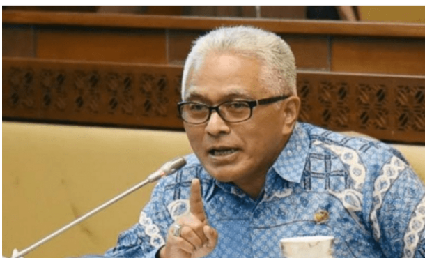
Fig. 7. PAN Politician Believes Right of Inquiry Will Not Be Realized Source: Akbar & Ramadhan (2024)

Red: Bilal Ramadhan Rep: Nawir Arsyad Akbar