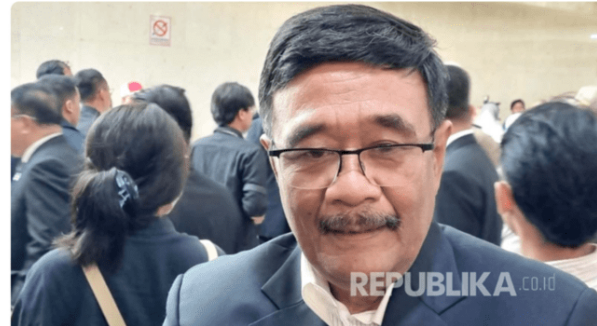
Fig. 6. PDIP: We Want the Government to Provide Answers Regarding Alleged Election Fraud