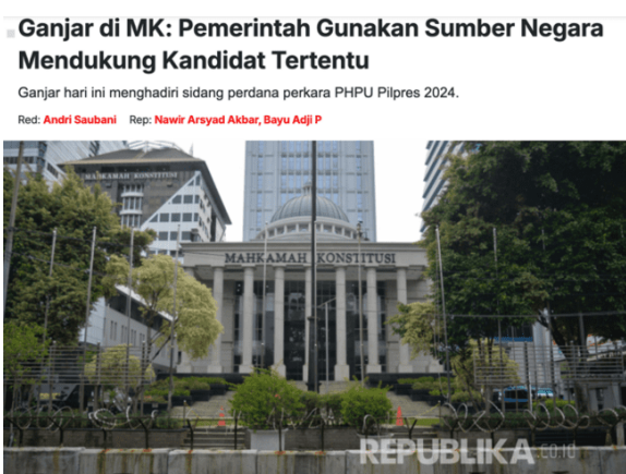
Fig. 10. Ganjar at MK: Government Uses State Resources to Support Certain Candidates

News 5: (Ganjar di MK: Pemerintah Gunakan Sumber Negara Mendukung Kandidat Tertentu) - Ganjar at MK: Government Uses State Resources to Support Certain Candidates (Wednesday, 27 March 2024) – (Akbar et al., 2024)