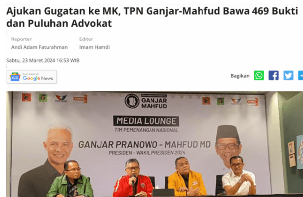
Fig. 2. File Lawsuit with MK, TPN Ganjar-Mahfud Brings 469 Evidence and Dozens of Advocates

News 2: ( Ajukan Gugatan ke MK, TPN Ganjar-Mahfud Bawa 469 Bukti dan Puluhan Advokat ) - File Lawsuit with MK, TPN Ganjar-Mahfud Brings 469 Evidence and Dozens of Advocates (Saturday, 23 March 2024) – (Faturahman & Hamdi, 2024)