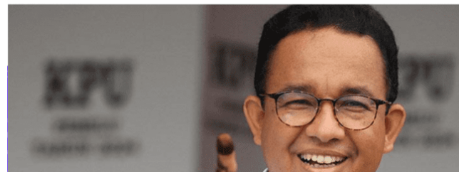
Fig. 4. Present at Presidential Election Dispute Hearing, Anies Baswedan Touches on Politicization of Social Assistance and Intervention by MK Leaders

The news above relates to the 2024 presidential election dispute hearing attended by Anies Baswedan at the Constitutional Court. Anies stated that there was an intervention of power from government institutions that caused a loss of independence in the implementation of the 2024 elections. From the analysis that researchers have conducted, there is a definition of problems or what is considered a problem in an event (define problems) with the intervention of the peak of power that causes elections not to proceed a luberjurdil . The interventionist actions of state officials led to the destruction of democracy in Indonesia. Tempo.co sees that the cause of the problem (diagnose causes) of election fraud is that the intervention of state administrators is the cause of elections not taking place in a luberjurdil manner. Various irregularities such as directing regional heads to win specific candidate pairs and misuse of social assistance by the government are examples. Therefore, the moral judgment reported by Tempo.co is to say that the acts of intervention from the top of power are a real threat to the stability of democracy in Indonesia. Meanwhile, the treatment recommendation given by Tempo.co is that the Constitutional Court, as a judicial institution, should be able to be objective and decide cases as fairly as possible so that fraudulent behavior by government institutions is not normalized in the future.