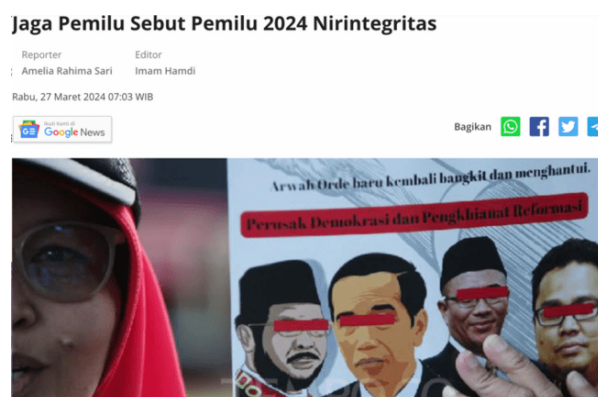
Fig. 3. Jaga Pemilu Calls 2024 Election Lack of Integrity

News 3: ( Jaga Pemilu Sebut Pemilu 2024 Nirintegritas ) - Jaga Pemilu Calls 2024 Election Lack of Integrity (Wednesday, 27 March 2024) - (Sari & Hamdi, 2024)