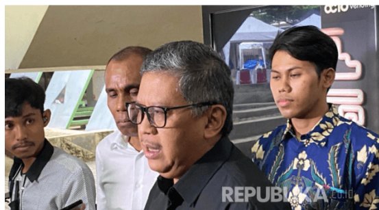
Fig. 9. Rejecting Gibran's Offer, PDIP Secretary General: We Prefer the Embrace of the People

Red: Bilal Ramadhan Rep: Nawir Arsyad Akbar