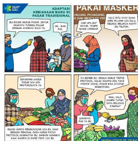
Fig. 2. Sehat Negeriku comic, titled “Pasar”

Comics can be an effective communication strategy in the marketplace to promote health and influence consumers. They can convey health messages in a light and entertaining way, using humor, engaging narratives, and relatable characters. This approach can help reduce consumer resistance to health messages and make them more acceptable, as demonstrated by Rokom (2021b).