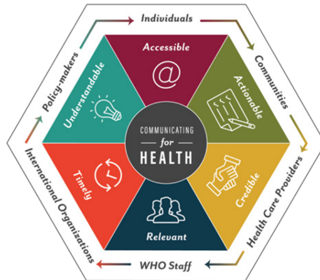
Fig. 1. Infographic of Effective Communication by WHO Source: World Health Organization (2023)