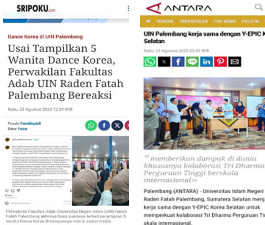
Fig 1. Documentation of Forms of Online Media Collaboration in Conveying Information Source: SRIPOKU.com & Antaranews.com

Based on the results of the documentation, the form of cooperation carried out by the Public Relations of Raden Fatah State Islamic University Palembang regarding online media in conveying information includes the following in the Figure 1.