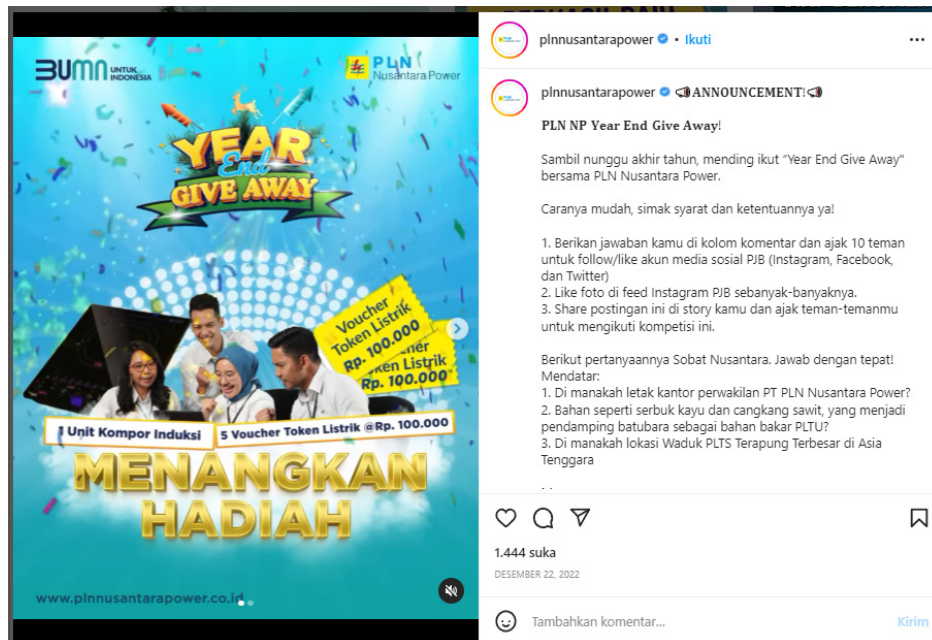
Fig 5. Giveaway program on IG @plnnusantarapower (PT PLN Nusantara Power, 2023)

The dissemination of collaborative content to the public is imperative to inform them about the diverse activities undertaken by the company. This transparency not only enhances public awareness but also bolsters the credibility and reputation of PT PLN NP. The substantial volume of collaborations is a testament to the company's commitment to various initiatives, further solidifying its standing in the industry. In addition to partnerships with external entities, PT PLN NP actively engages with its followers on Instagram. Through interactive activities like giveaways, followers actively participate in spreading the reach of the @plnnusantarapower account.