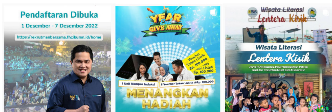
Fig 3. Management Of Communication Elements On IG @pln Nusantarapower (PT PLN Nusantara Power, 2023)

Effective communication is at the heart of managing the IG account @pln Nusantarapower. This pivotal element focuses on conveying messages that are both good and highly useful, fostering growth in followership while ensuring audience comfort. IG management officers conduct meticulous research to discern community needs and emerging trends to achieve this. Based on this understanding, content crafting carefully aligns with these needs and PT PLN NP's unique conditions. The public perceives tangible benefits from the content shared by tailoring messages to these specific requirements and prevalent trends. The content strategy encompasses diverse topics, including updates on the recruitment of state-owned enterprise (BUMN) employees, insightful tips, thought-provoking quotes, engaging quizzes, and exciting giveaways. Additionally, the IG account highlights PT PLN NP activities that serve the public interest. These efforts are meticulously planned and executed to create a meaningful impact and foster a positive relationship between the company and its audience.