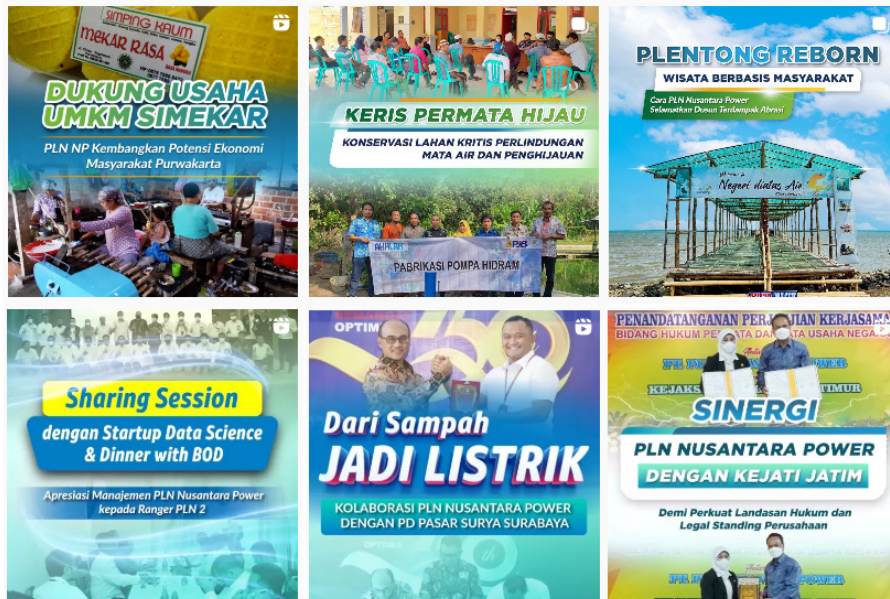
Fig 4. Content from Company Collaboration On IG @plnnusantarapower (PT PLN Nusantara Power, 2023)

The dissemination of collaborative content to the public is imperative to inform them about the diverse activities undertaken by the company. This transparency not only enhances public awareness but also bolsters the credibility and reputation of PT PLN NP. The substantial volume of collaborations is a testament to the company's commitment to various initiatives, further solidifying its standing in the industry. In addition to partnerships with external entities, PT PLN NP actively engages with its followers on Instagram. Through interactive activities like giveaways, followers actively participate in spreading the reach of the @plnnusantarapower account.