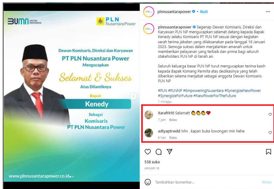
Fig 6. Comments on IG @plnnusantarapower (PT PLN Nusantara Power, 2023)

The last element managed by IG management officers is connection. The manifestation of this element is ensuring that the content created is up-to-date, appropriate, and corresponding. Designs are beautifully crafted, captions are always clear and match the visuals displayed, and uploads are done before the moment gets stale. This case is necessary because maintaining a good IG appearance will make connecting more accessible for people. They know this account is managed and not idle, so they can get trusted and latest information from this IG account. In addition, IG management officers also maximize the interaction features available on IG accounts. Users can leave comments and messages, either in the form of support, questions, or criticism, as follows: