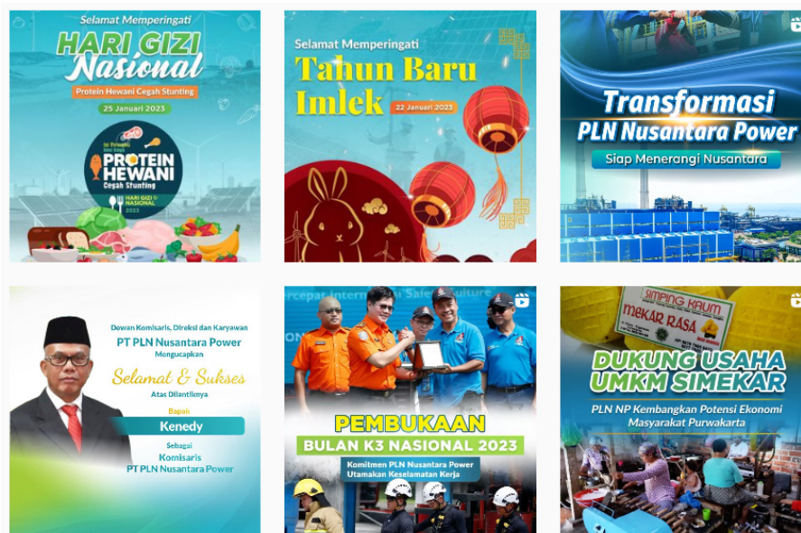
Fig 2. Management Of Context Elements On IG @plnnusantarapower (PT PLN Nusantara Power, 2023)

The context management on the @plnnusantarapower Instagram account operates dynamically, responding to the evolving conditions and achievements of PT PLN NP. To ensure focused and optimal message conveyance, officers meticulously schedule content creation. The content curated for the account encompasses various topics essential for public awareness, ranging from the inauguration of power plants and environmental maintenance to the celebration of company achievements. Moreover, the content strategy includes general informative materials encompassing holidays, lifestyle tips, and entertainment. What distinguishes the @plnnusantarapower account is its intentional departure from monotonous, corporate-centric content. Instead, the account strategically integrates a variety of general interest topics, enhancing its appeal and informativeness to followers. This approach is aimed at sustaining the audience's interest and engagement, acknowledging the multifaceted interests of the Instagram community.