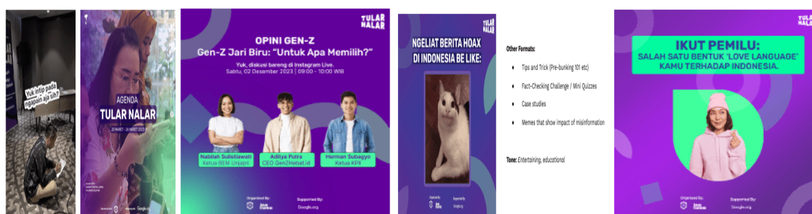
Fig.4. Content Pillar of online campaign: “GenZ Bisa Milih.”

Leveraging cultural and issue trends, the campaign targets first-time voters with a youth-friendly approach, using a range of formats that are entertaining and educational. Given their high levels of confidence and perception of greater knowledge than their peers and family, the content will help them communicate pre-bunking expertise to friends and older generations. This includes content such as tips on media literacy and on engaging your friends in an inoffensive manner. The campaign addresses community-related voting issues during the elections, including challenges like online voter list checking, assisting the elderly with information verification, and providing guidance on locating polling stations. Four content pillars categorize Tular Nalar’s social media content as derivatives of the “Gen-Z Bisa Milih” Strategy. 1) Politalk: Related information about elections and democracy covered with Gen-Z Trend/Pop Cultures in Indonesia. It provides answers, gives information, and encourages young voters to vote. 2) Literaksi: Equip the young voters across Indonesia with pre-bunking knowledge and critical thinking, 3) Opini Gen Z (Gen Z Opinion): Sharing opinions from young voters’ POV related to politics, democracy, elections, and hoaxes, 4) Tular Nalar: FaQ/ BTS/ Project Information about Tular Nalar & the online campaign: “Gen-Z Bisa Milih”.