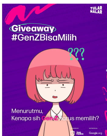
Fig.1. Carousel Content of Tular Nalar Instagram.