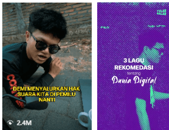
Fig.3. Relevance Type of Content Tular Nalar.

Tular Nalar can create a stronger connection with younger audiences, who prefer content that is entertaining yet still educational, thereby enhancing the relevance of the message and increasing their active participation in important issues.