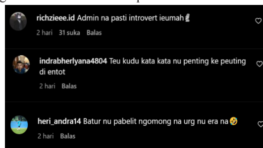
Figure 3. Negative Comments on @simamaungcom's Humorous Content

Audience engagement patterns also fluctuate with situational context, particularly the outcomes of football matches. After victories, humorous posts celebrating team success tend to attract lively comment threads filled with memes, playful banter, and expressions of pride, amplifying the shared joy and reinforcing the Bobotoh community's collective identity. However, as shown in Figure 3, not all audience reactions are uniformly positive. Some negative comments reveal the challenges media managers face in meeting diverse audience expectations, since humor is inherently subjective and can be interpreted differently across individuals. This variation indicates that while humor effectively increases engagement, it also invites a range of emotional responses. Conversely, during defeats or controversies, @simamaungcom strategically employs humor to diffuse tension and reframe disappointment as a moment of shared resilience rather than individual frustration. This adaptive use of humor aligns with Meyer's (2000) assertion that humor functions as a coping mechanism, enabling communities to process adversity collectively without fragmentation. Through this approach, humor not only sustains audience engagement during emotionally difficult periods but also redirects attention from temporary discouragement toward collective perseverance and solidarity.