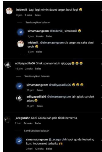
Figure 2 Positive Comments on Humorous Content @simamaungcom

into dynamic, co-creative exchanges that strengthen communal bonds.