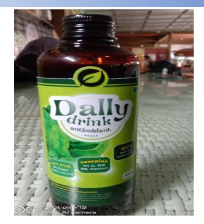
Fig.1. Dally's functional drink contains chlorophyll from spinach and calcium from banana peels

The chemical activity of water or often called water activity (water activity) and abbreviated as Aw is a measure used to determine the ability of water to assist microbiological, enzymatic, chemical damage processes or a combination of these three processes. The higher the value of water activity, the food will be more vulnerable to attack by microorganisms [5]. The pH value is related to the quality of food products. Products with low pH values generally tend to be more durable because it will be difficult for microbes to grow in media with high acidity [12]. The pH value of 4.19 is classified as acidic which can help this drink last longer.