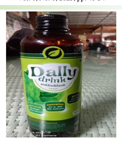
Figure 1. Dally's functional drink contains chlorophyll from spinach and calcium from banana peels

The chemical activity of water or often called water activity (water activity) and abbreviated as Aw is a measure used to determine the ability of water to assist microbiological, enzymatic, chemical damage processes or a combination of these three processes. The higher the value of water activity, the food will be more vulnerable to attack by microorganisms [5]. The pH value is related to the quality of food products. Products with low pH values generally tend to be more durable because it will be difficult for microbes to grow in media with high acidity [12]. The pH value of 4.19 is classified as acidic which can help this drink last longer.