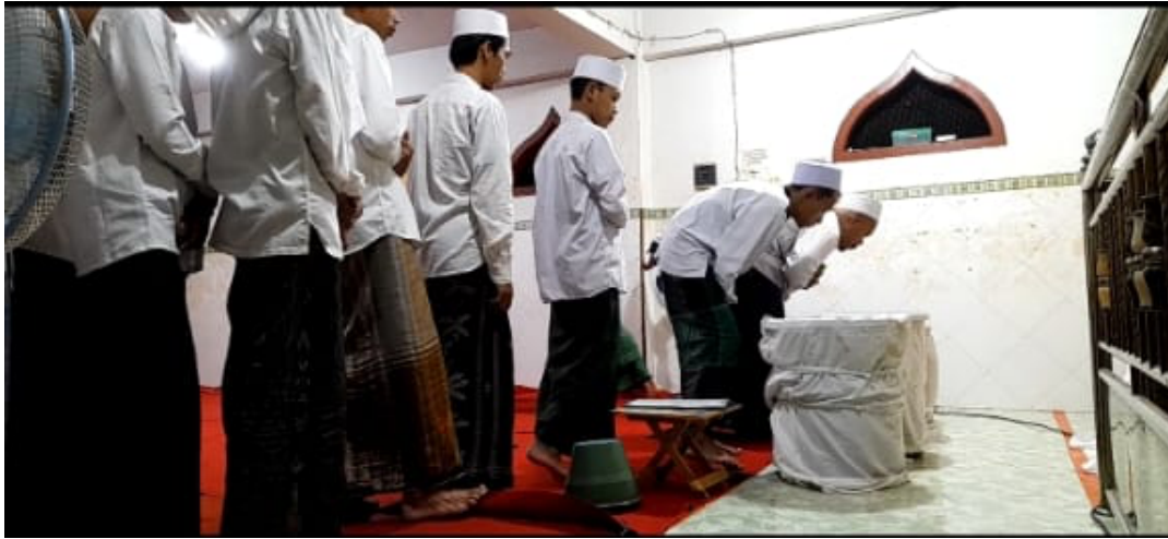
Fig 2. The water and Sand in Mujahadah Prepare Phase

This aligns with the research by Alfarisi (2021). Facilities and infrastructure in the context of fiqh studies are also called Al Wasilah or intermediaries that can lead to the goal. The objects found in AA are imbued with the efficacy of wirid , which is believed by AA congregants and is by the ethics of prayer, namely the existence of belief (Al-Ghazali, 2011). The water and sand contained in the mujahadah preparation phase (FMP) are the media used to blow the results of the wirid that is read can be seen in Fig. 2.