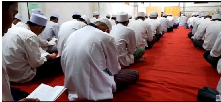
Fig 4. Sitting cross-legged, Facing the Qibla